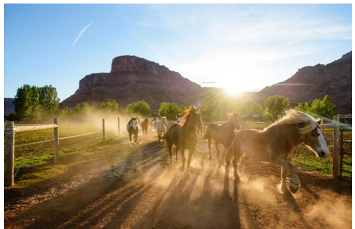
Sunset at the Ranch